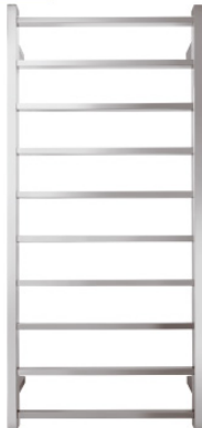
Square tubes TW110