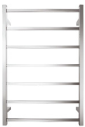
Square tubes TW107