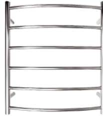
Round tubes - Curved TW090