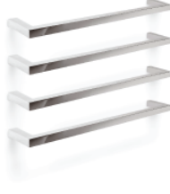
Single bar - Square TW002