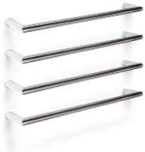
Single bar - Round TW001